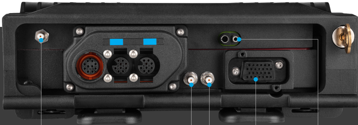
RF antenna port

When the mission takes you out of range, you risk being left in the dark. The APX 8500, equipped with SmartConnect, can reroute P25 voice and data communication over broadband via built-in Wi-Fi or a tethered LTE/satellite router. Stay connected to your P25 radio system, even when outside of P25 coverage.