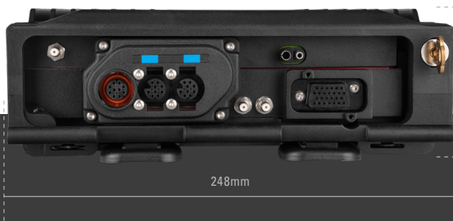
APX 8500 High-Power Model Shown